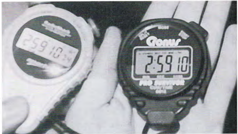
It doesn't get any better than this! The two official watches totally agree on the new record time of two hours, 59 minutes, and 10 seconds.